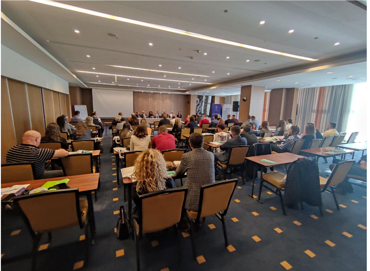
PIC2: Opportunities for PwDs through social entrepreneurship, From the Sarajevo, BiH conference, October 2022