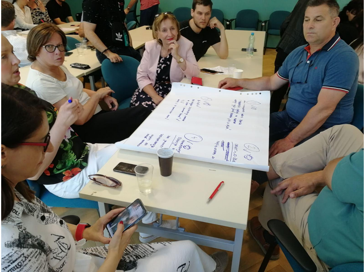
PIC1: Croatian team working on inputs for Web accessibility standards in online education, From the Prague, Czech Republic, conference, June 2022